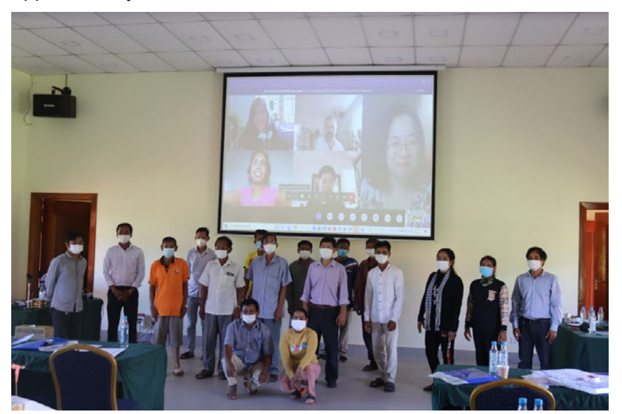
Training on fruit tree cultivation

Assisted remotely by the members of the ICRAF team, NAPV has been providing ongoing support through consultations with the ToT farmers on-site on their farms, as well as through the Telegram group, and will continue to do so. The project provided fruit tree seedlings and crop seeds to all ToT members including 14 fruit tree species (jambolan plum, jujube, guava, avocado, longan of fragrant aril, longan of thick aril, jackfruit of carrot variety, durian, orange, coconut, pomelo, sapodilla, rambutan, date palm and custard apple) and 3 fruit crops (dragon fruit, papaya and pineapple) as well as 10 vegetable crops (pea eggplant, long eggplant, chili, ginger, galangal, turmeric, morning glory, tomato, snap bean, tomato), in addition to 4 wild tree species ( Azardirachta indica, Pterocarpus macrocarpus, Dalbergia cochinchinensis and Afzelia xylocarpa ). Thanks to COVID-19 travel restrictions being further relaxed, ICRAF team members have been preparing for further in-person, on-site technical support in May 2022.