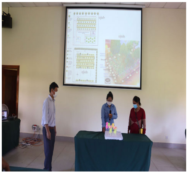
Agroforestry design presentations made by project village representatives

The agroforestry characterization survey (Activity 1.2) selected 10 of 55 observed agroforestry practices in the 4 project villages. These have been recommended as models because they have been shown to generate relatively high income (ranging from some USD per ha in 2020), host diverse agro-biodiversity (i.e., minimum three different crop species), and have been practised by the farm households for more than five years, and according to farmers' perspectives, are more resilient to extreme weather events such as drought and strong winds. The project report also describes establishment and annual maintenance cost, and gross and net income in 2020 generated by the 10 selected practices.