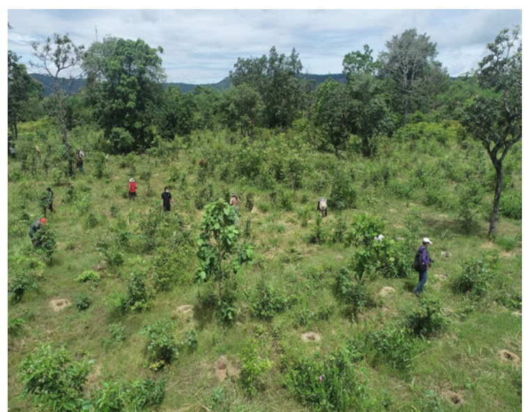
Enrichment planting with native trees at Ko Muoy, Sra-aem commune

By the end of March 2022, some 18,325 seedlings of 20 tree species ( Annex 4.11 ) had been planted in 6 areas (8,430 seedlings in the first year, and 9,895 in Year 2), including 4 restoration sites along road sides of Eco-village, and opposite the new nursery, covering an area of around 8 hectares. Caring for planted and naturally established seedlings was carried out over an area of 4.9 hectares; moreover, a total area of 7.6 hectares of firebreaks at 5 locations was accomplished. These efforts involved some 19 villagers (11 women) who participated in the restoration activities.